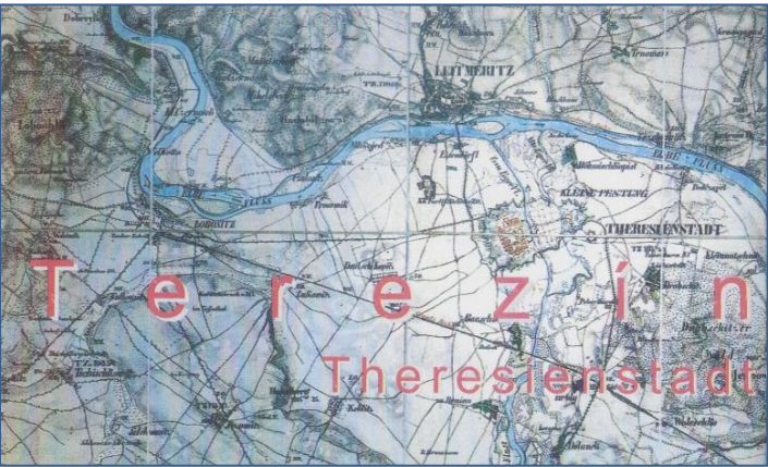
1- Map of Theresienstadt and Environs

„During Hitler’s regime Theresienstadt was called a „Ghetto“. Nowadays it is defined as a concentration camp. I also called it „Ghetto“, because to me it differed from Auschwitz, Dachau and Buchenwald, those camps whose names I knew. First we were chased out of our residences and cramped into so called „Judenhäuser“ = „houses for Jews“. Then they were ready to send us to a Jewish settlement. That is why I refer to it as „Ghetto“, logically speaking. But it is obvious, that this expression is misleading. A ghetto as normally understood was not a camp of prisoners, but a section of the city designated for Jews. Theresienstadt however was the stable attached to the slaughter-house“. (Ruth Klüger, weiter leben = how to continue living, Göttingen 1992, p. 81.)